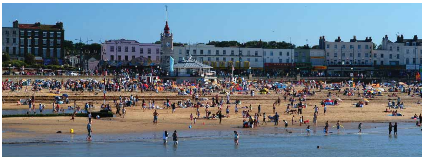
Above: Margate Main Sands