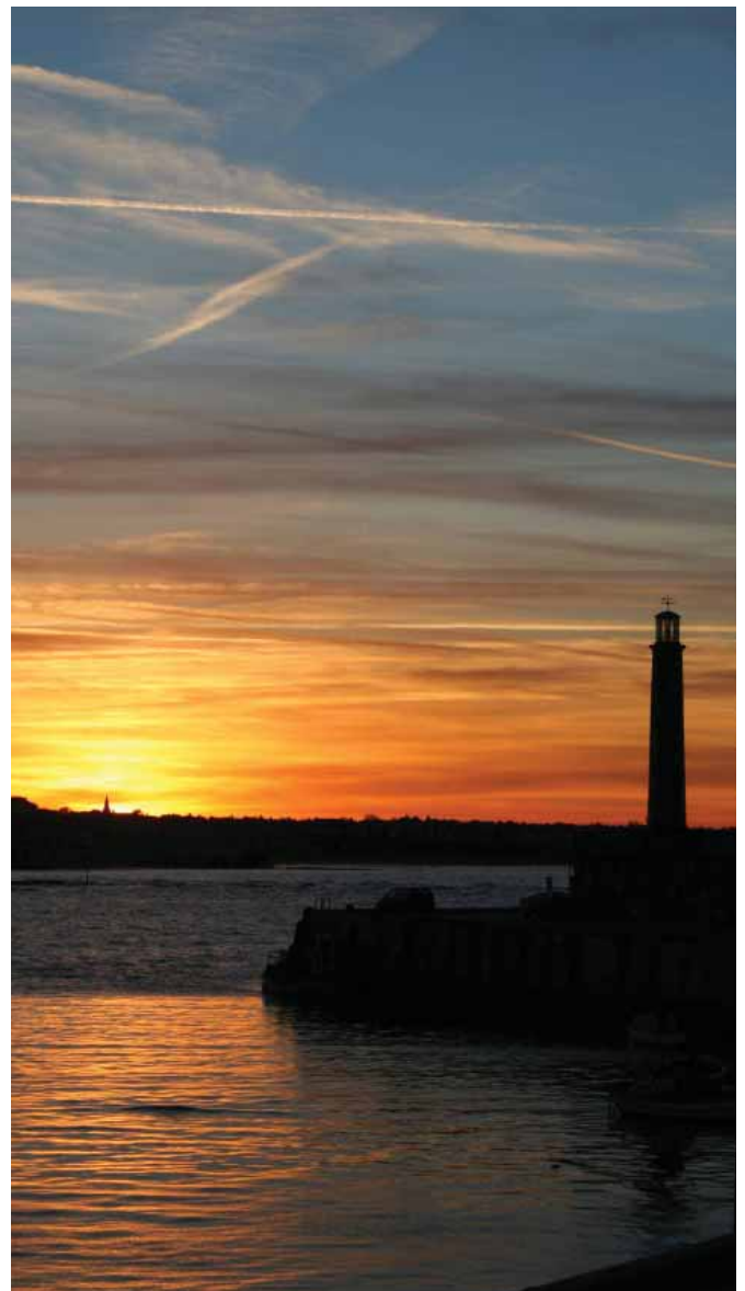
Above: Margate pier

Margate will have developed a new identity that celebrates its seaside heritage and its future - an identity that is owned by the local community and reaches out to the world.