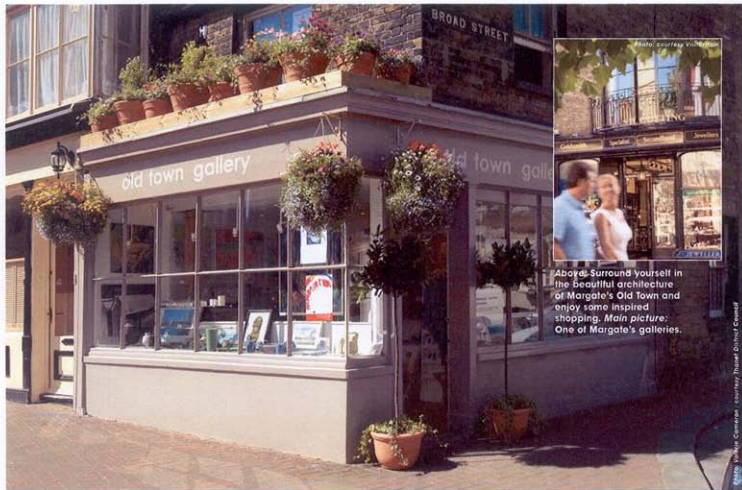
Above: Surround yourself in the beautiful architecture of Margate's Old Town and enjoy some inspired shopping. Main picture: One of Margate's galleries.